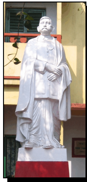
Statue of Girish Chandra Ghosh, Kolkata

There were few sins in which Girish Babu had not indulged. He once said to us, “I have drunk so much wine in my life that if the wine bottles were placed one upon another, they would stand as high as Mount Everest.” He was a poet, so he spoke poetically like that. Truly speaking, he did drink a lot. When he was asked by [Sri Ramakrishna] to repeat the name of God morning and evening, he refused to do so. He said: “I am not sure I can do it. I do not know in what condition or where I may be at those hours.” Then Sri Ramakrishna asked him to remember God before meals. “That also I cannot promise you,” replied Girish Babu. “I am often engrossed in lawsuits and have to attend to all sorts of things. I can’t even do that.” At this Sri Ramakrishna said, “Then give me the power of attorney.”