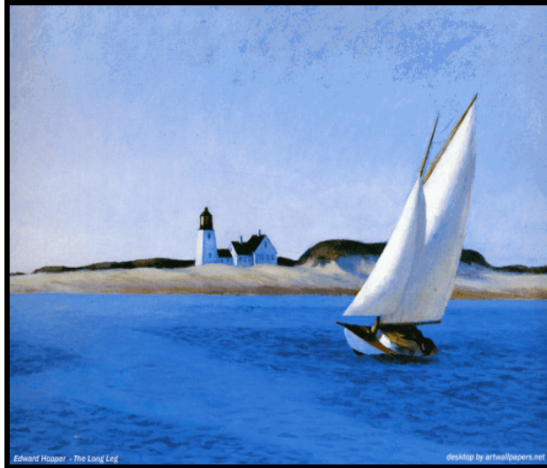
The Long Leg , Edward Hopper (American, 1882-1967) Huntington Library Collection

friends. But suddenly I felt an urge to visit Sri Ramakrishna. My friends and I hired a carriage and drove out to Dakshineswar. It was late at night, and everyone was asleep. The three of us entered Sri Ramakrishna's room, tipsy and reeling. Sri Ramakrishna grasped both my hands and began to sing and dance in ecstasy. The thought flashed through my mind: ‘Here is a man whose love embraces all — even a wicked man like me, whose own family would condemn me in this state. Surely this holy man, respected by the righteous, is also the saviour of the fallen.’