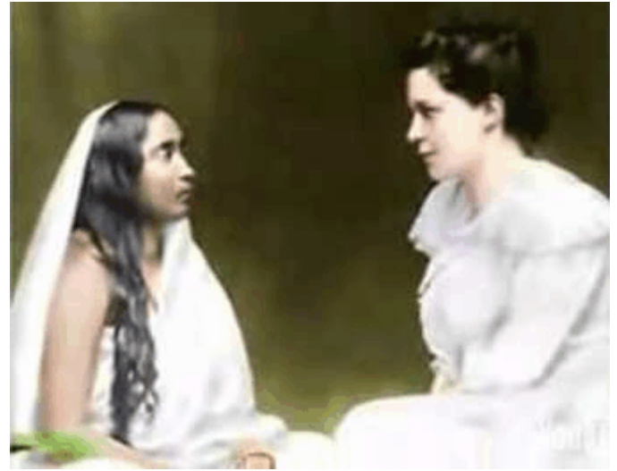
Holy Mother and Sister Nivedita Talking

It was not easy in those days in India to accept Western people [due to the then extreme rigidity of the Hindu Caste system]. They were regarded as maleech [or mlechcha – meaning, without caste (out-caste), literally “heathen,” as in Christianity or “ kafir ” in Islam], cow eaters, pork eaters, beef eaters. People would say, “They are so defiled. Do not allow them in my temple or near my person.” But the same