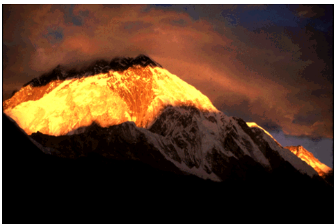
Sunset view of towering, snow-capped Mt. Everest, from the village of Lobuche (Solu-khumbu), Nepal.

Giri-raj or the “King of Mountains,” is also a deity of itself in the Hindu pantheon. The most visited places of pilgrimage in India are located in the Himalayas. Prominent among them are the Nath troika of