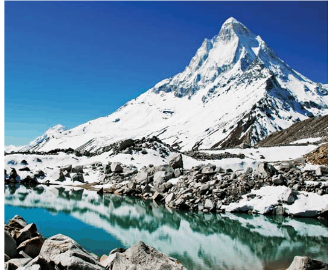
Shivaling Peak and a lake in the Himalayas, near Gangotri Glacier, northwestern Uttarakhand state, India.

Himalayas. Swami Vivekananda founded his Mayavati Ashram 50 km from Almora. The Mughul emperor Jehangir said about Kashmir, the westernmost extent of the Himalayas: “If there is a paradise on earth, it is here.”